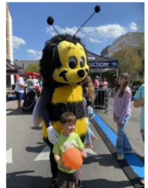
Buzzy was there for hugs and photos.